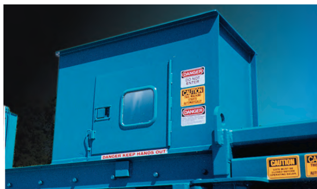
The optional chute feed hopper with inspection door and interlock switch will accommodate pneumatic, gravity, or conveyor feeding systems.