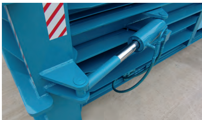
Marathon's Stealth Series balers feature a hydraulic door latch.