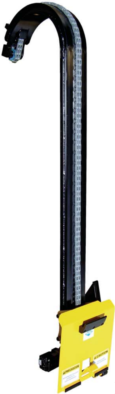
The AC300 US-type Carriage shown with Cane Track