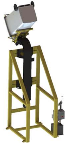
Canes may be mounted to sidersloaders, roll-off containers, or dockside stands